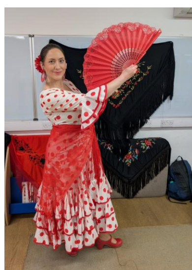
We had an amazing day and enjoyed sessions in Spanish Flamenco dancing, African Drumming, Ecuador landscape and culture, Indian customs and Spanish food and weather.